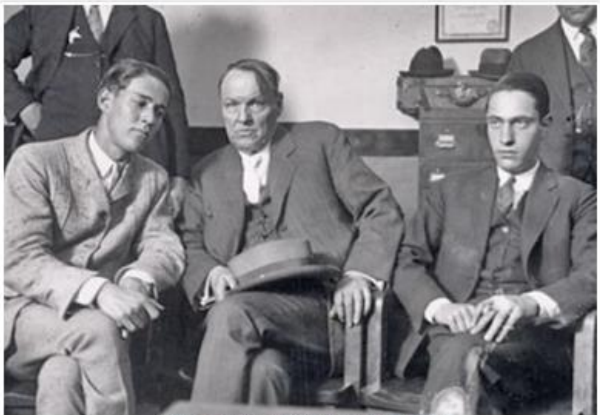
Left to right: Loeb, Darrow, and Leopold. Source.

Leopold and Loeb's families were wealthy, and engaged three lawyers to defend them, including Clarence Darrow, the most famous lawyer in America. (The next year he was the major defense attorney in the Scopes "Monkey Trial".) Darrow, who also lived near me in Hyde Park, is a hero of mine: dedicated to fighting for the underdog, fiercely smart and eloquent, and an outspoken determinist and atheist.